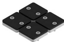
6"x6" Riser Kit