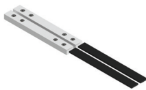
PITBUL 28"x3" Riser Kit